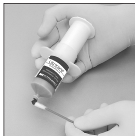
Fig. 2 Deliver Ultracare from the large, no-waste IndiSpense syringe to cotton applicator, cotton roll, etc., for placement.