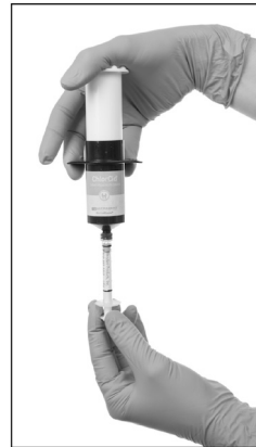
Fig. 1: A 5ml or 1.2ml (as shown) unit dose syringe is twisted firmly onto the IndiSpense syringe. While supporting plunger of unit dose syringe with the nondominant hand, depress plunger of the IndiSpense and fill unit dose syringe to desired level.