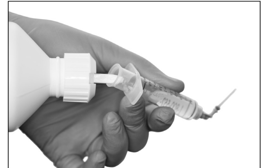
Fig. 2: A 16oz. bottle has plunger removed of the 5ml or 1.2ml (as shown) syringe. Backfill the syringe with irrigant from the bottle. Reinsert plunger and remove the entrapped air.