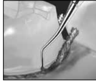
Ultrapak ® Packer

3. Pack Ultrapak ® cord soaked in ViscoStat.