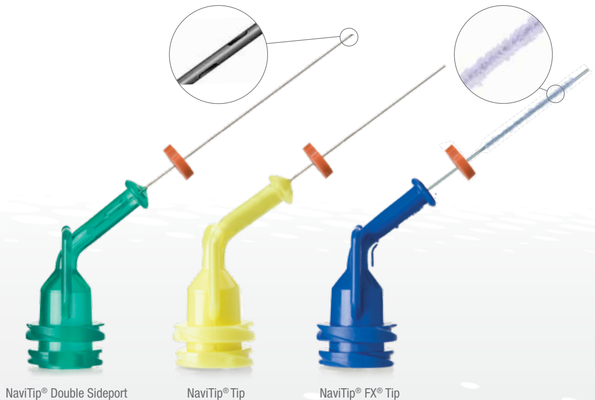
NaviTip® Double Sideport

When it comes to root canals, Ultradent is with you every step of the way.